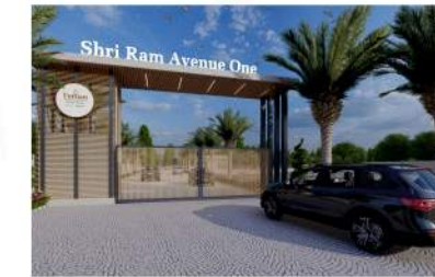
Shri Ram Avenue One Ajmer Road

RERA Reg. No.: RAJ/P/2023/2431 www.rera.rajasthan.gov.in