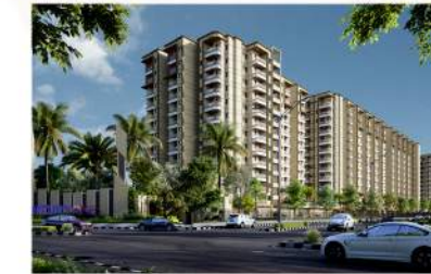
City Homes Century One Thikariya, Jaipur

RERA Reg. No.: RAJ/P/2023/2652 www.rera.rajasthan.gov.in