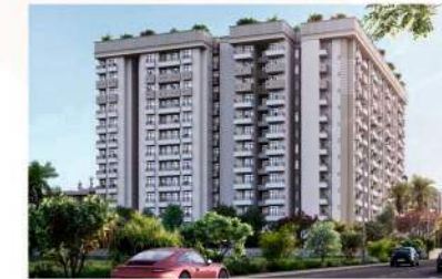
The Century Garden Mansarovar Extension, Jaipur

RERA Reg. No.: RAJ/P/2023/2652 www.rera.rajasthan.gov.in