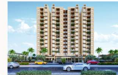
The Century Elite Bhankrota, Jaipur

RERA Reg. No.: RAJ/P/2023/2620 www.rera.rajasthan.gov.in