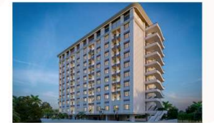
Turban Residency Mahindra SEZ, Jaipur

RERA Reg. No.: RAJ/P/2025/4036 www.rera.rajasthan.gov.in